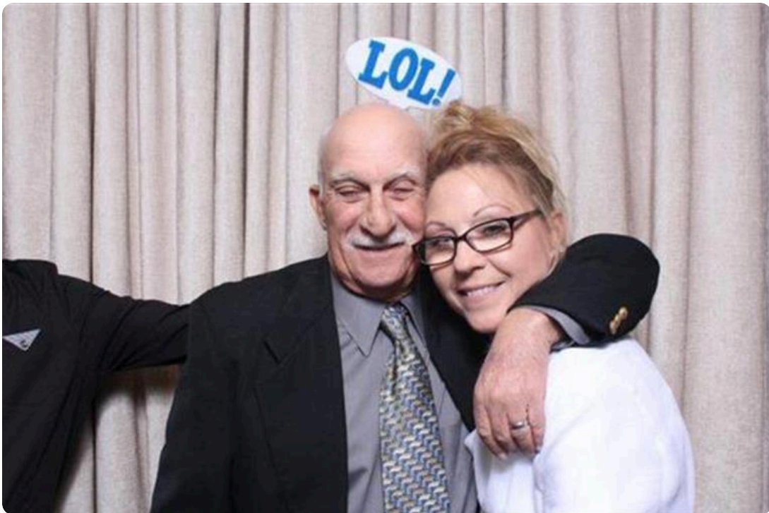
Jan. 17, 2016