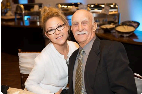
Jan. 17, 2016