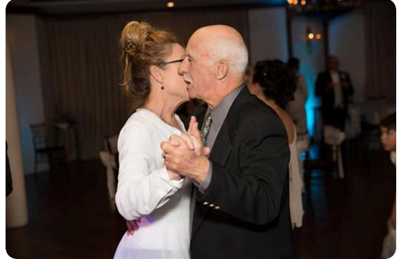
Jan. 17, 2016